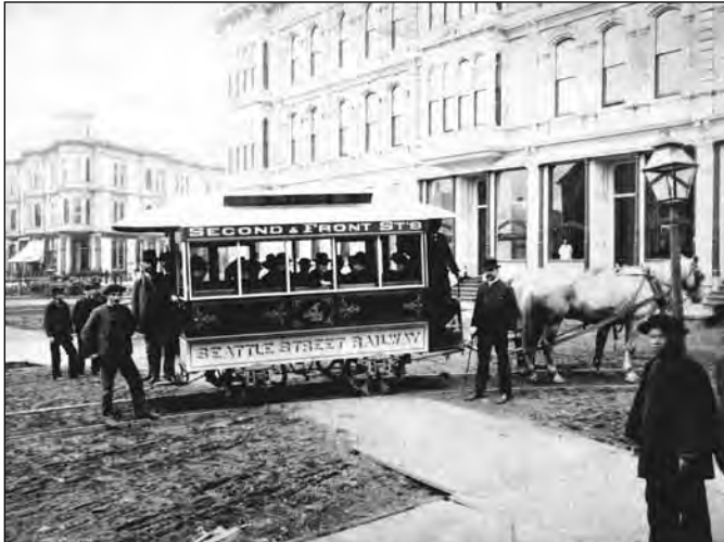
Seattle's first street car at Occidental Avenue and Yesler Way, c. 1884.