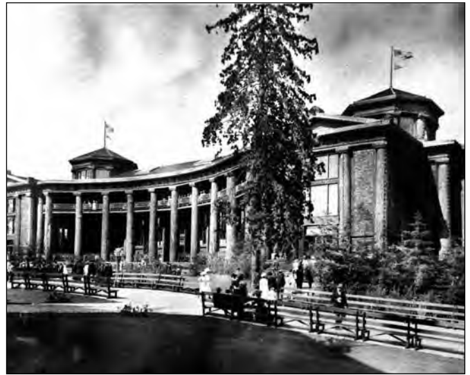
The Forestry Building of the Alaska Yukon Pacific Exposition, 1909.