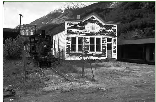
Klondike Gold Rush National Historical Park