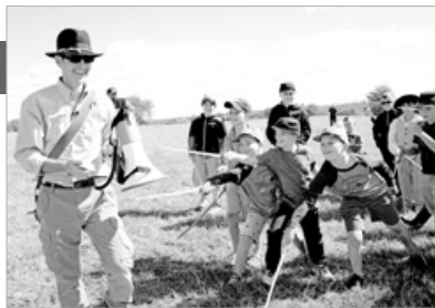
Swordplay at a Civil War Trust Generations event at Brandy Station, 2017.

Battlefields are part of our national heritage, scenes of struggle and sacrifice where American soldiers lost their lives. The Civil War Trust is working to preserve these “hallowed grounds,” as Abraham Lincoln called them, so that future generations can learn from them and can learn to appreciate their hard-won freedom.