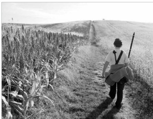
A battlefield tromper at Antietam.

One of the Trust's most popular resources is the Traveling Trunk, which is booked on a regular basis from August through June. In the five Traveling Trunks, teachers will find all manner of hands-on materials, ranging from cotton bolls with seeds, faux mini balls, replica uniforms, music CDs, and videos. Also included are lesson plans to help teachers engagingly employ these materials. This school year, the Trust's five Traveling Trunks will reach 2,500 students in 72 schools in 35 states.