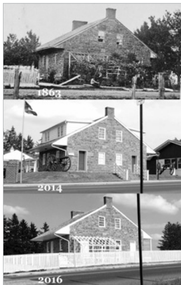
The Civil War Trust purchased and meticulously restored and interpreted General Lee’s Headquarters at Gettysburg.

All of the Trust’s cutting-edge history education materials are free. Its programs are rich and varied to reach people in meaningful ways in the classroom, on the web, on battlefields, in books and media, and at events. The Trust’s website, civilwar.org , is a repository of exceptional digital material tailored to classroom use. There, tens of thousands of teachers can access more than 100 videos in the “Civil War In4” series, topical videos that address crucial events, issues, and personalities of the Civil War such as U.S. Grant, the Emancipation Proclamation, and army organization. Teachers rave about the “In4” videos because they are judiciously edited to be used in the classroom. The site also has thousands of articles, biographies, and other videos, and photos seen by millions of people each year. The Trust’s site features as well its Civil War Curriculum, which provides a wide range of