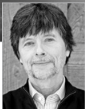
Ken Burns